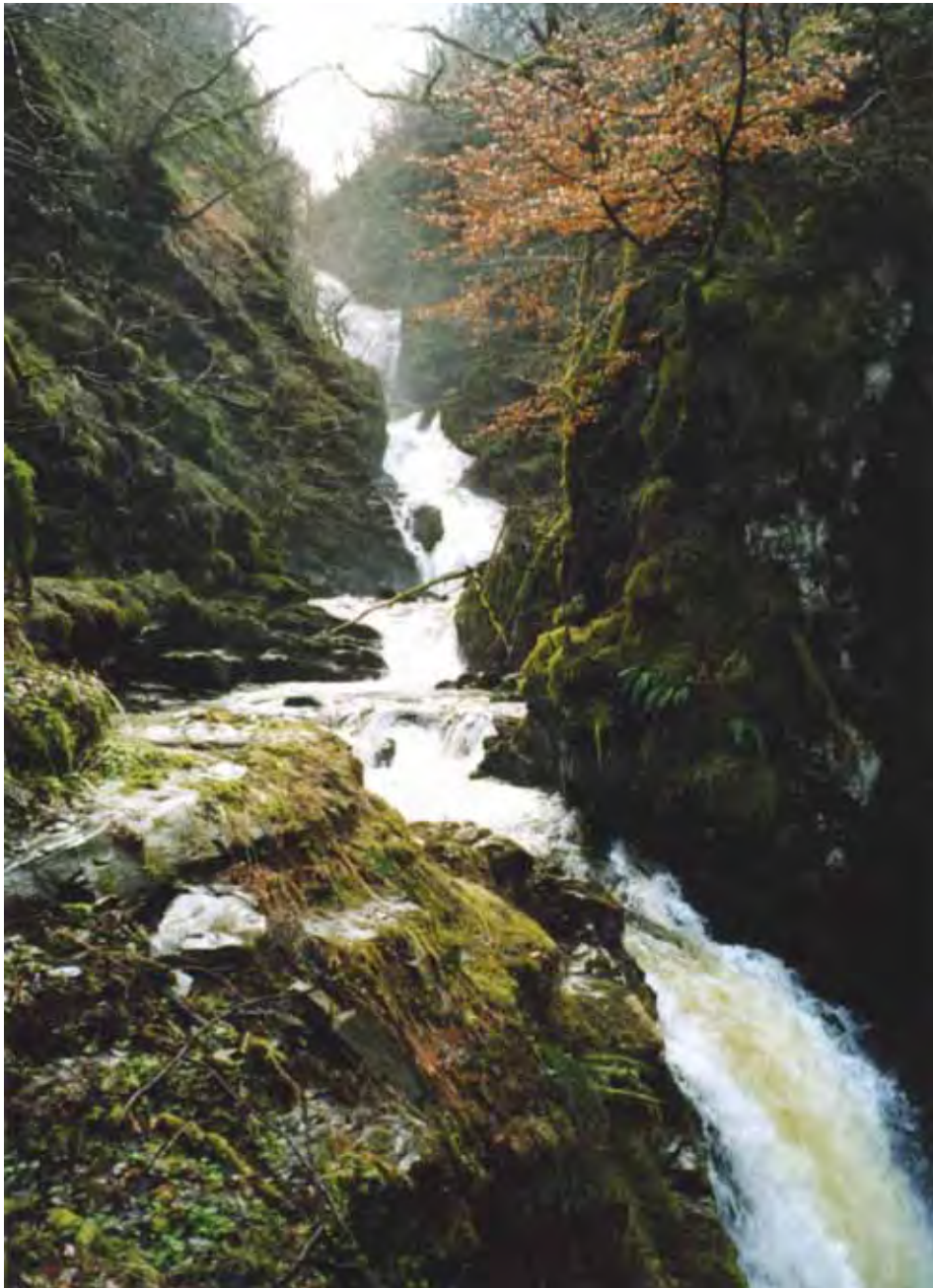
Photograph A for Question 4